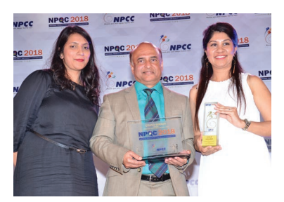
Haemophilia Association of Mauritius