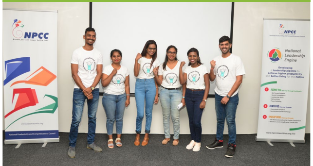
Montagne Blanche Youth Centre