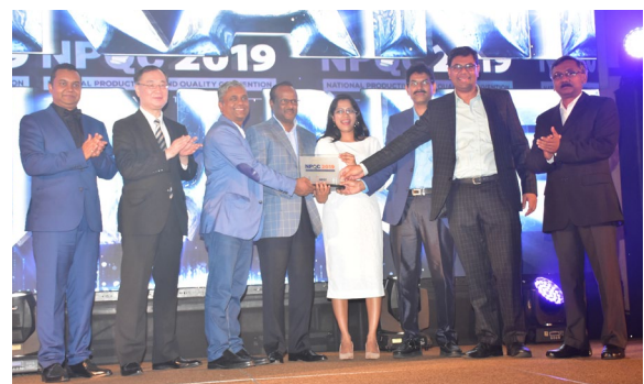
Rajiv Gandhi Science Centre