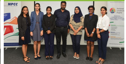
Rose Belle Youth Centre