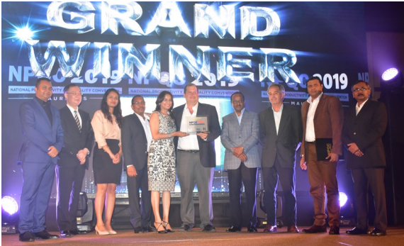
Phoenix Beverages Limited