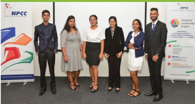
Souillac Youth Centre