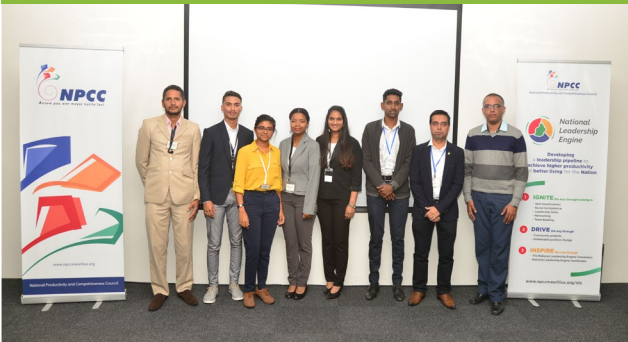
Helvetia Youth Centre