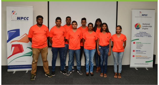
Bambous Youth Centre