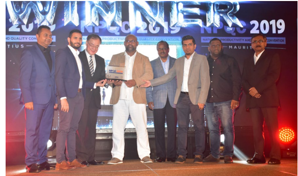
Natec Medical Ltd