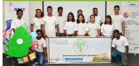
Pamplemousses Youth Centre