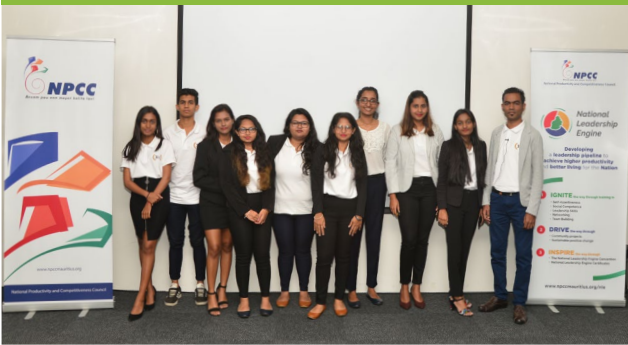
Floréal Youth Centre