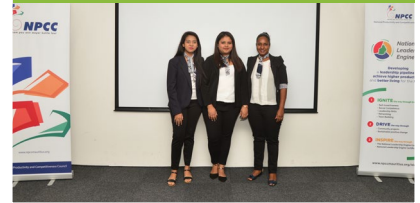
Rivière du Rempart Youth Centre