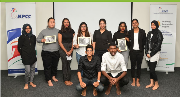
Port Louis Youth Centre