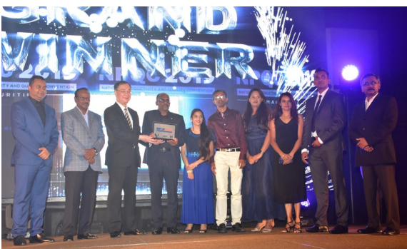
Employees Welfare Fund

GOVERNMENT/PARASTATAL BODIES AND REGISTERED ASSOCIATIONS