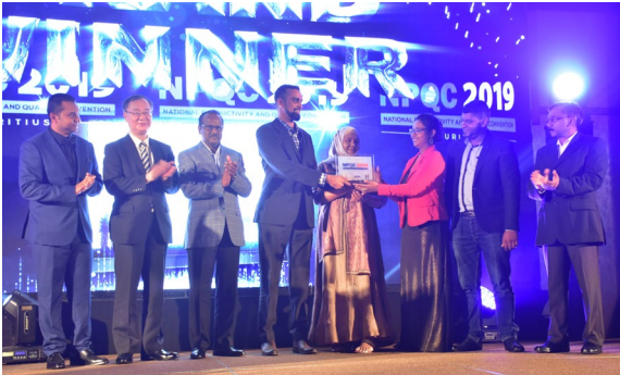
Neel Trading & Facilities Ltd

SMALL AND MEDIUM PRIVATE ENTERPRISES INCLUDING MICRO ENTERPRISES