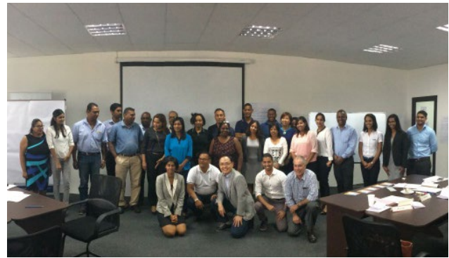
Members of the middle management of the three Model Companies

Members of the top and middle management of the Model Companies, namely Axess, Scomat and Rey & Lenferna, had the opportunity to participate in training sessions led by the two Japanese experts.