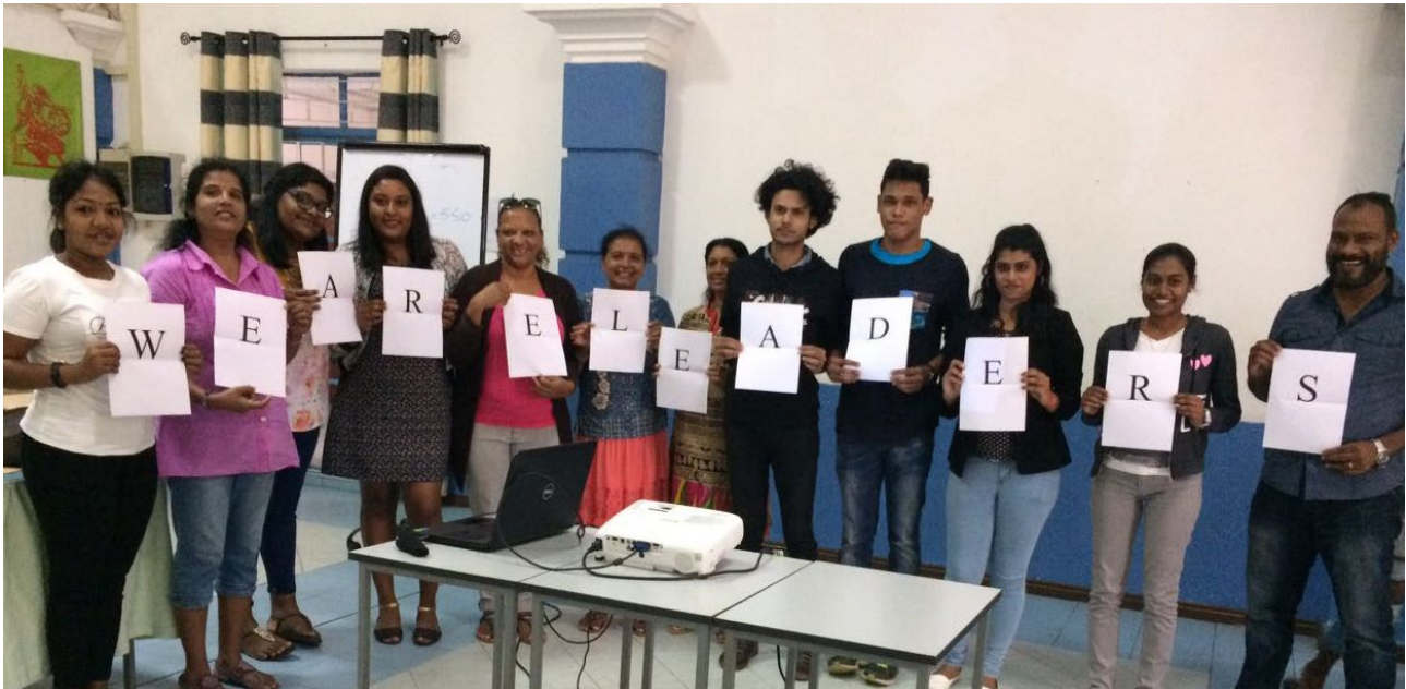
Young people from the Helvetia Youth Centre showed great enthusiasm in the sensitisation session.

Young people between 14 and 35 years old have been sensitised on leadership during the months of August, September and October in the youth centres of the nine districts of the island.