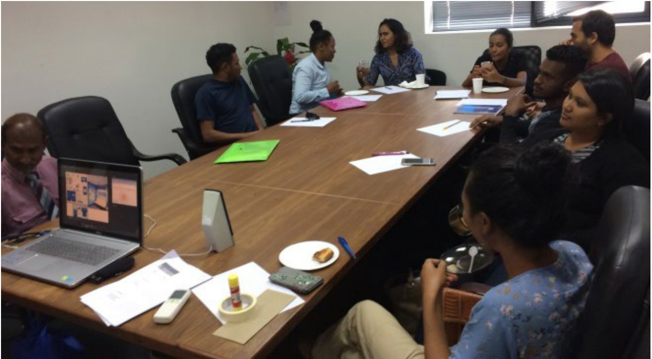
The course focused on business goals and business models, leadership and developing capabilities.

The NPCC partnered with the Jeune Chambre Internationale (JCI) to help young and aspiring entrepreneurs in applying methods and techniques that could give a boost to their businesses and increase their productivity through the Higher Productivity for Young Entrepreneurs course.