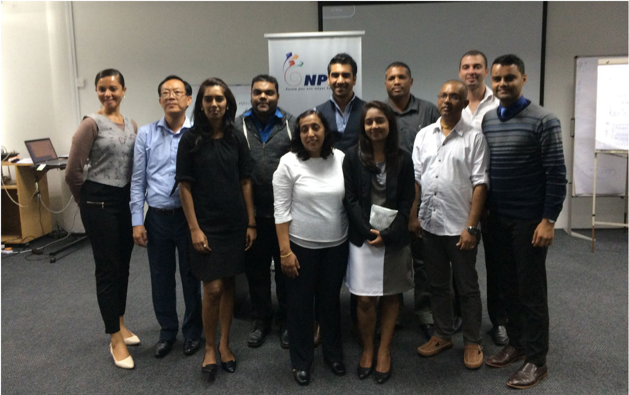
The participants gave a highly positive feedback about the delivery of the course.