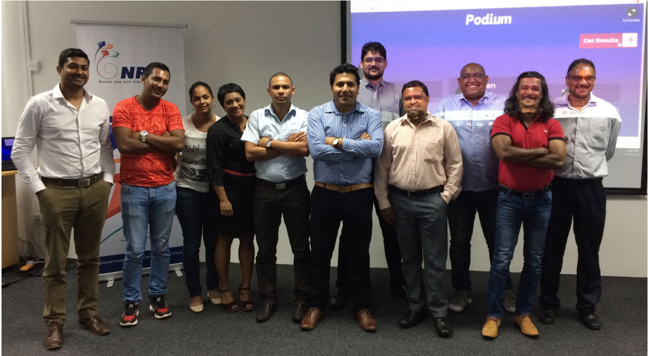
The participants learned how they can calculate risks and enhance their supply chain.

Heightening competition among companies to grab a larger part of their market share means that no one can afford to sit on their laurels no matter how successful their business is. Understanding what it takes to ensure a smooth production and considering every little risk affecting operations has become a critical must for everyone.