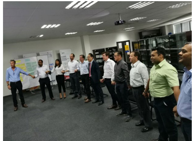
Members of top management of the model companies

Members of the top and middle management of the Model Companies, namely Axess, Scomat and Rey & Lenferna, had the opportunity to participate in training sessions led by the two Japanese experts.