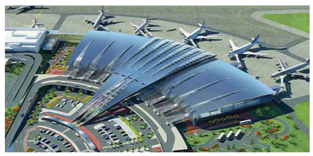
The new Airport of Mauritius ready to boost competitiveness.

MAURITIUS RANKS AMONG THE TOP 10 COUNTRIES IN THE WORLD FOR ECONOMIC FREEDOM ACCORDING TO THE WORLD ECONOMIC FREEDOM REPORT INDEX 2013 PUBLISHED BY THE FRASER INSTITUTE. THE FRASER INSTITUTE IS A CANADIAN THINK TANK. ITS STATED MISSION IS "TO MEASURE, STUDY, AND COMMUNICATE THE IMPACT OF COMPETITIVE MARKETS AND GOVERNMENT INTERVENTION ON THE WELFARE OF INDIVIDUALS."